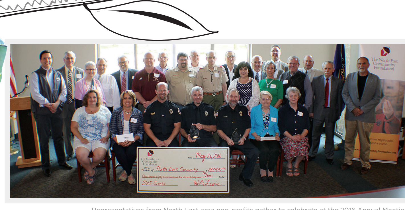
Representatives from North East area non-profits gather to celebrate at the 2016 Annual Meeting.